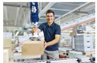
Lifting systems and cranes