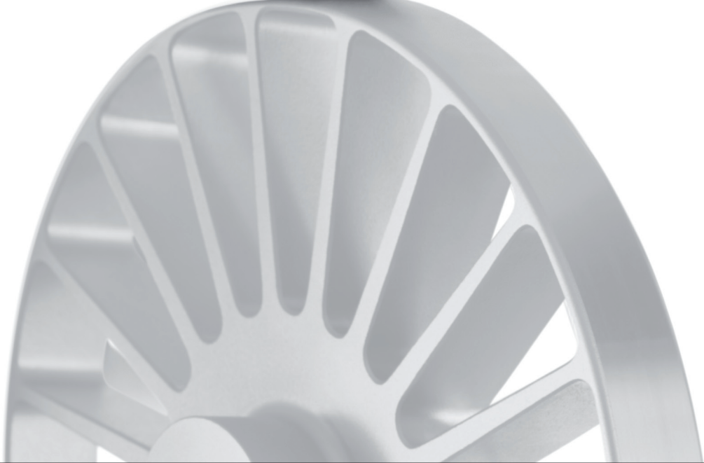
Impeller from the Fristam FZ