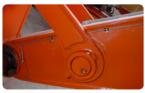
The shielded, galvanized-steel lubricant line at the tip of the hydraulic excavator's stick assures high dependability.