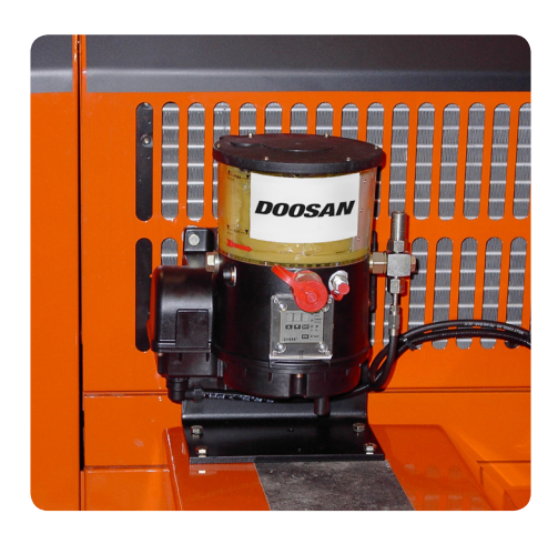
KFGS piston pump with 2 kg grease reservoir and filler socket installed on a DOOSAN DL 250 wheel loader.