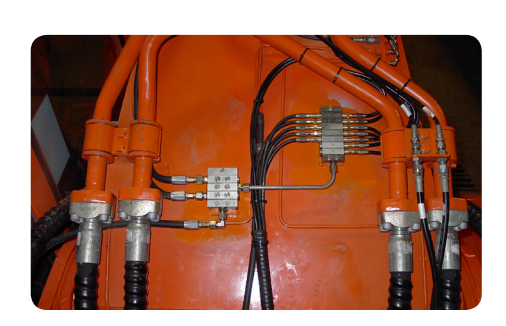
Hydraulic excavator DX 480 Exact metering of lubricant via VPM-3 master feeder and VPKM-7 boom feeder - installed on boom foot to facilitate maintenance.

for the lines and optimal laying are specially important tasks!