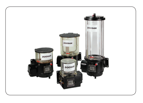
The KFAS/KFGS generation of pumps with integrated control system. Rugged design together with the latest technology.