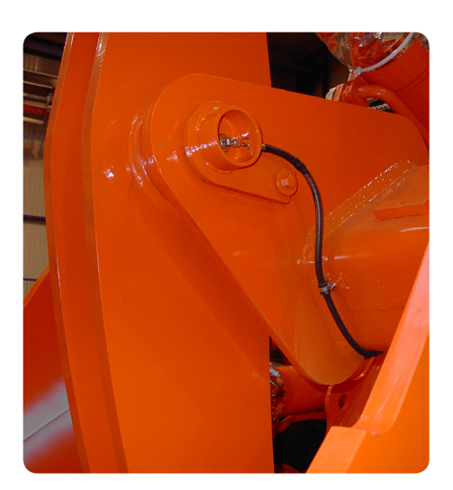
A welded ring at the lube point for the reversing lever / cross member on theDL 250 wheel loader protects the line connections from damage