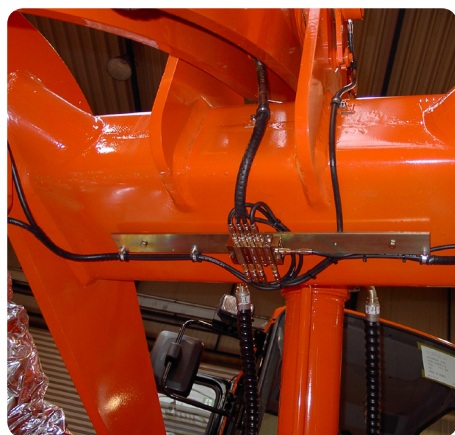
VPKM-5 progressive feeder installed on mounting plate on the cross member.