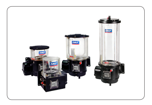
The KFAS/KFGS generation of pumps with integrated control system. Rugged design together with the latest technology.