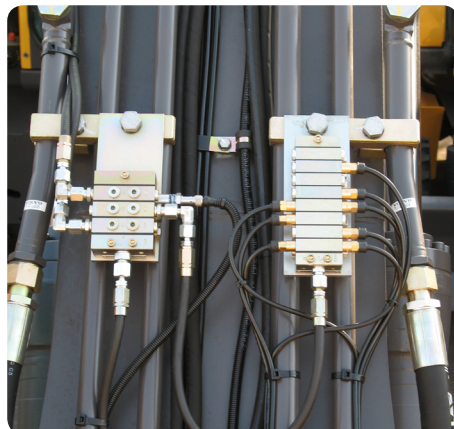
VPM-3 progressive feeder with cycle switch as the master feeder and a VPKM-8 boom feeder installed on the boom of a Volvo hydraulic excavator.