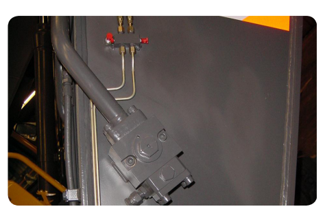
Twin manifold with lube nipple used to fill the bearings on the stick tip and link with lubricant, e.g. after repairs or conversions.

Welded-on adapters protect the lube point from damage!