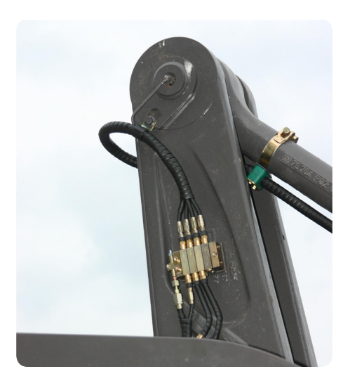
VPKM-4 progressive feeder used supply the TP linkage on Volvo wheel loaders. All the high-pressure hoses are sheathed in wear-proof coils for their protection.