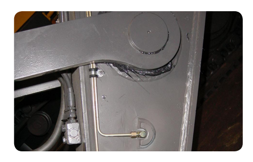
Connection of the stick tip to an EC460B Volvo hydraulic excavator.

for the lines and optimal laying are specially important tasks!