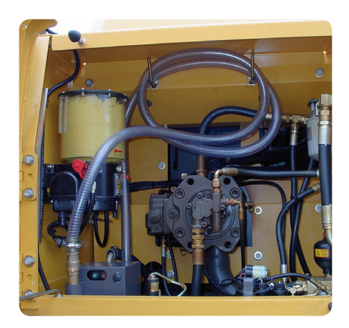
KFGS piston pump with 6 kg grease reservoir installed in a secure and easy-to reach place on an EC210B Volvo hydraulic excavator.