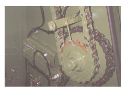
Universal spreader with lubrication of the spreading mechanism's drive chain.