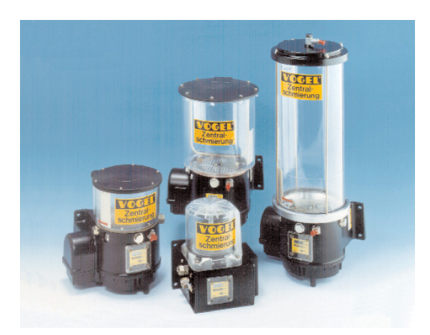
KFAS/KFGS with integrated control system. Rugged design together with the latest technology.

Group KFAS pumps with an integrated IG502-I control unit come with a 1-liter plastic reservoir. 3 pump elements are available for the 2 lubricant outlet ports connected to 2 mutually independent lube circuits.