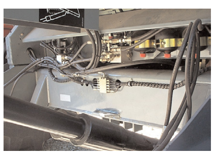
Progressive feeders on the front axle for supply of lube points on leveler (balance).