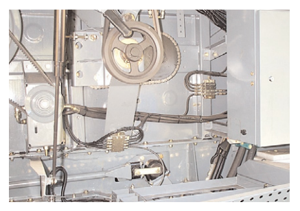
Partial view of a combine harvester with master feeder and lube point feeders.

Drastic reduction of wear and maintenance costs. VOGEL central lubrication – an investment that pays off!