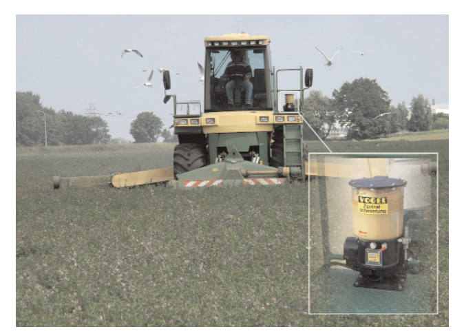
KFGS3-5 installed on a self-propelled mowing machine.