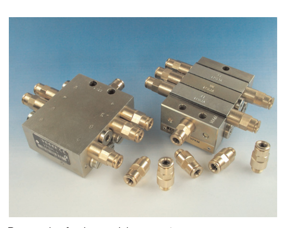
Progressive feeders, quick connectors