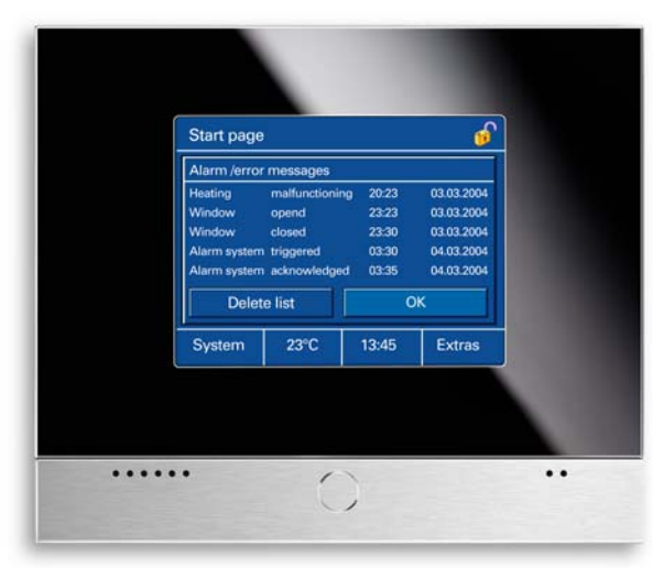
The LEAN- and SMARTtouch provides alarm or alarm-response messages with a date and time stamp.

While the light is switched on and off in a familiar way with the upper button, the lower buttons serve to, for example, control the blinds as well as different light scenes for reading, working or watching television.