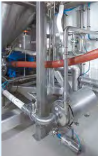
Booster pump for Cleaning In Place

when products are added and at certain points to stimulate recirculation and mixing of the mass. Before the cream can be discharged into drums, a QC sample is taken and analysed in the laboratory.