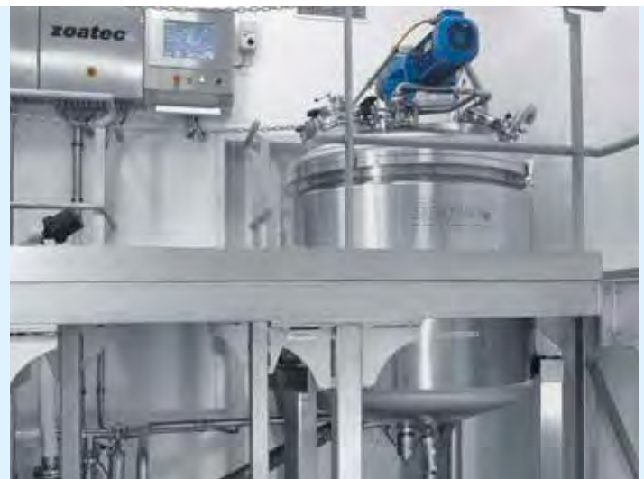
Melt vessel for melting and heating of fats and oils