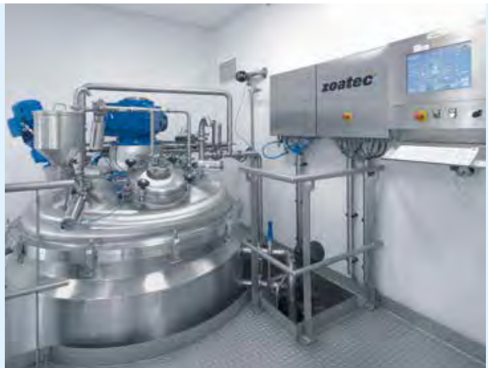
Process vessel with zoamatic control