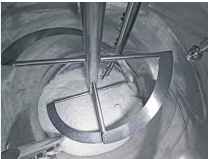
Agitator with scrapers in the melt vessel

heated fats can be transferred automatically using the homogeniser. Process steps in the melt vessel and in the process vessel can be controlled independently. This enables considerable time savings in the complete production process.