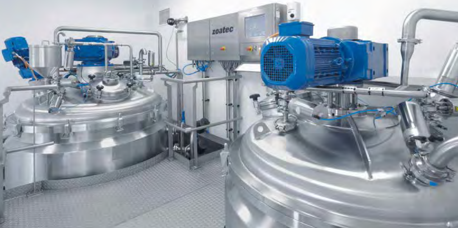
Good access to process vessel and melt vessel