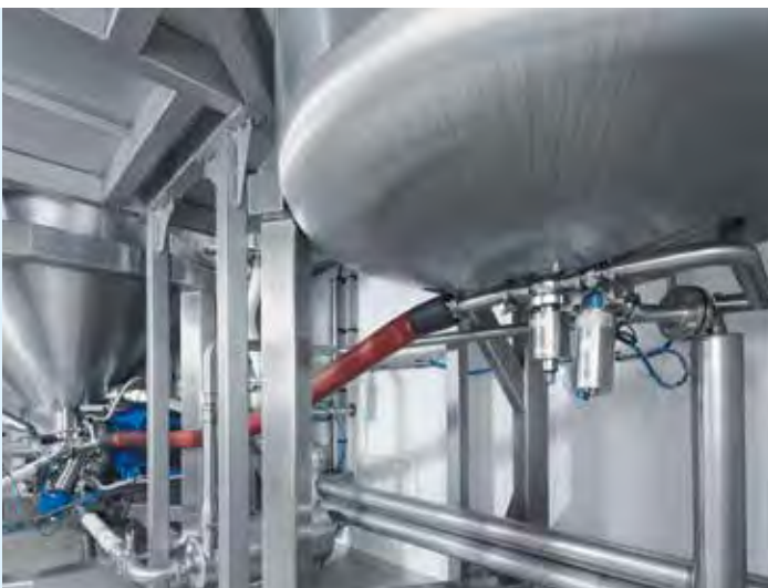
Insulated transfer line from the melt vessel to the process vessel