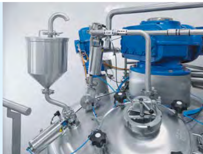
Feeding hopper for liquid raw materials