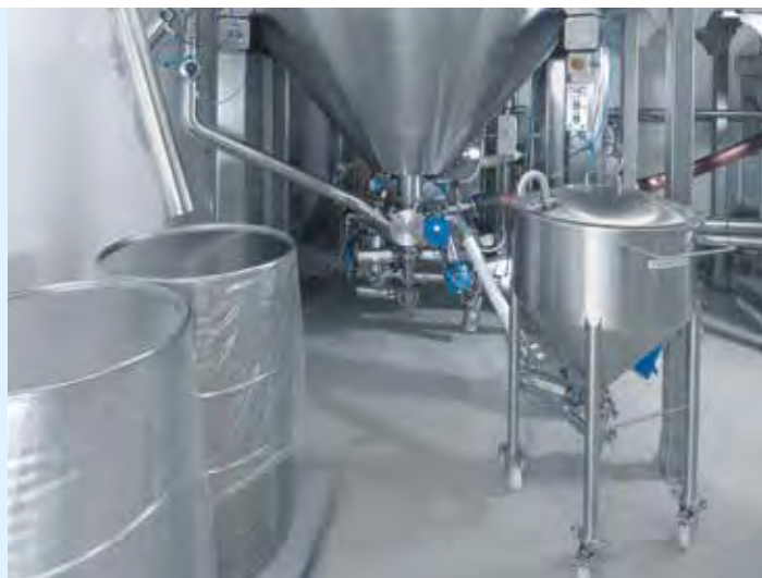
Feeding hopper for powdered raw materials

The homogeniser has a critical impact on the production of ointments and crèmes. Excellent dispersal of droplets and particles is required to manufacture stable emulsions and suspensions. With the powerful homogeniser, times for homogenisation are considerably shorter. The sophisticated design reduces wear on the parts, mechanical seal included, thus increasing their lifetime.