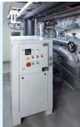
Supply module for heating and cooling the process vessel and melt vessel