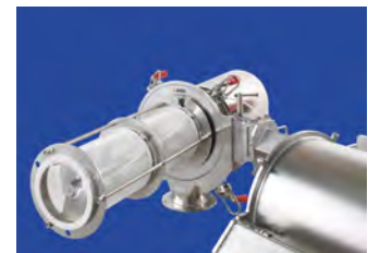
Screen basket swivelled out