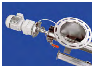
Dosing screw extractable

to the side for quick inspection, the screen fabric can vibrate freely and is thus self-cleaning • Nickel chromium steel design in different surface versions as desired by customer