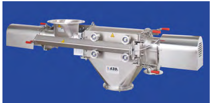
AZO cyclone screener type DA

Shortly before the weight set for the particular receptacle is reached, the connected weighing device automatically transmits a pulse for speed reduction to the bin unit of the cyclone screener. Thus quantity of product getting into the screening frame is reduced. This coarse/fine switch over, enables achieving the optimum switch-off point that ensures exact weighing of the screening product.