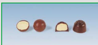
Standard One-Shot pralines, truffle balls, eggs, liqueur pralines