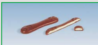
Long One-Shot filled bars