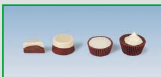
Double-Layer Power One-Shot