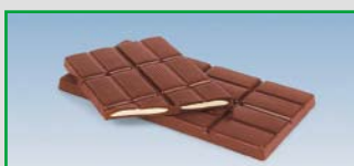
Long One-Shot tablets