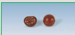
One-Shot with ingredients