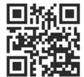
Find out more