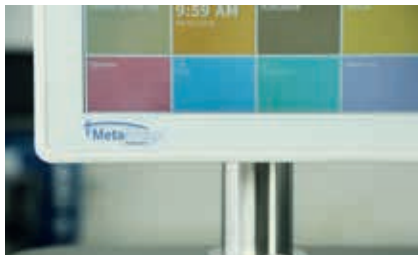
Touchscreen with web-based MetaBridge software