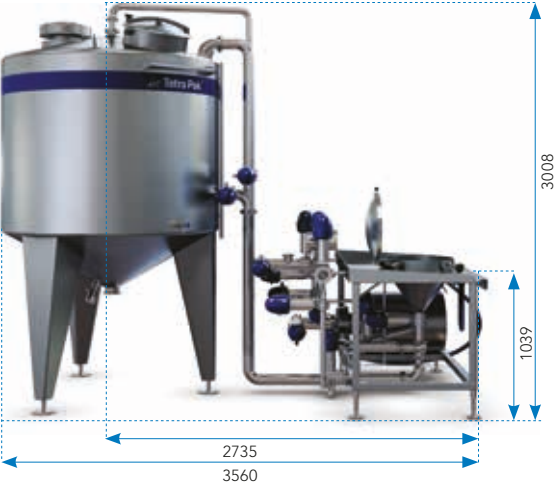
Measurements in mm